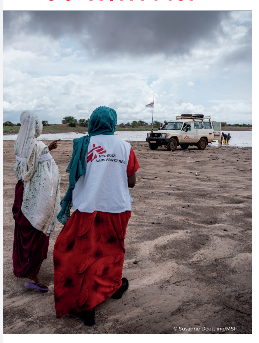
Médecins Sans Frontières 14-34 avenue Jean Jaurès 75019 Paris