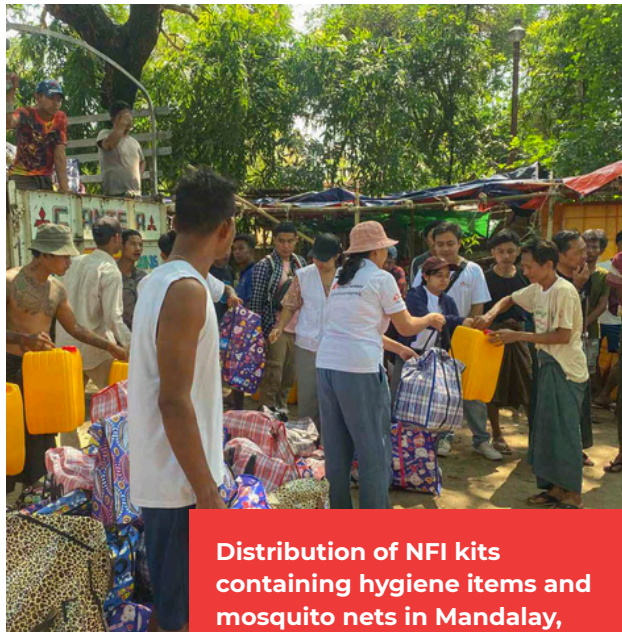
Distribution of NFI kits containing hygiene items and mosquito nets in Mandalay, Myanmar.