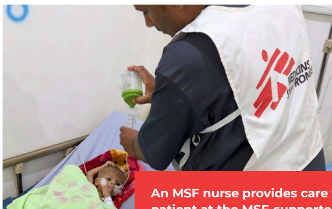
An MSF nurse provides care to a patient at the MSF-supported facility in Ad-Dahi Hospital in Al Hudaydah, Yemen.